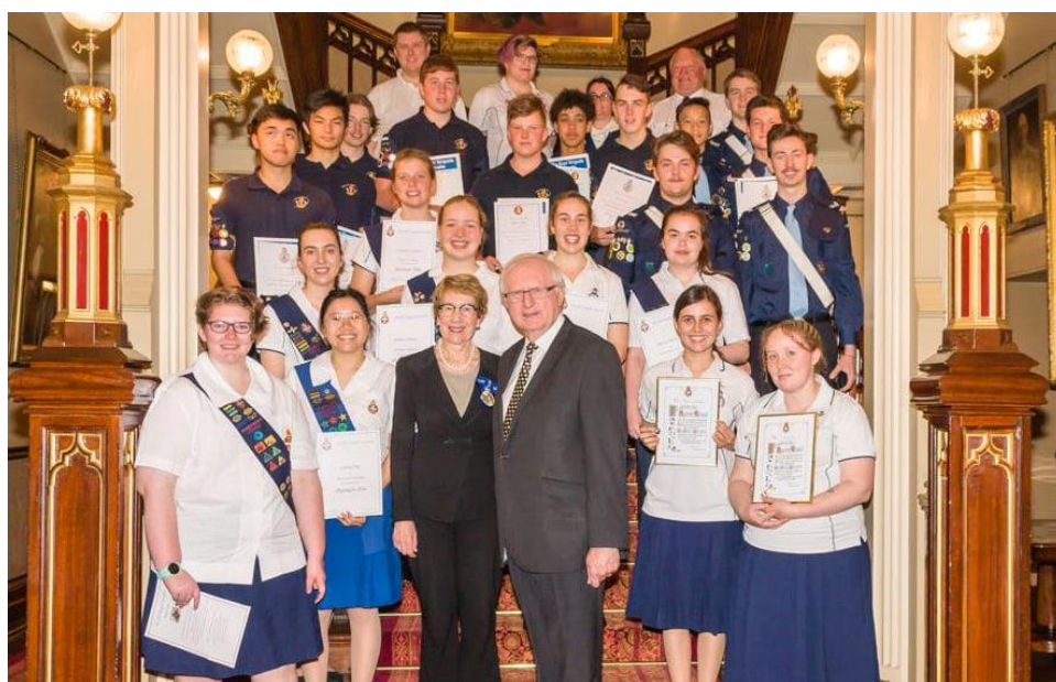
2019 NSW Girls' and Boys' Brigade Awards presentation